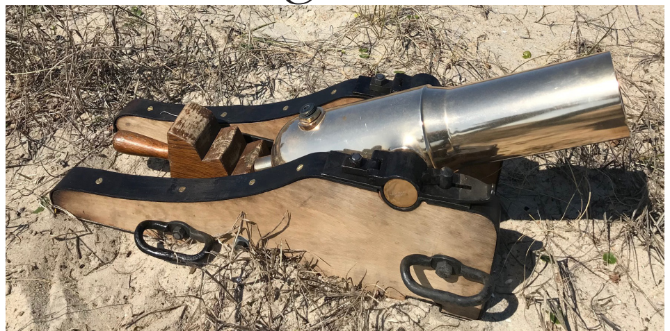
The completely rebuilt carriage of the Lyle Gun as it is set for a firing test

A popular piece of the attractions of the Chicamacomico Station for the last 20-some years has been the Beach Apparatus Drill (aka, the breeches buoy demonstration). Arguably, the highlight of the Beach Apparatus Drill is the firing of the Lyle Gun. At the command "READY!" and with a mighty roar and cloud of white smoke, the small (continued on page 7)